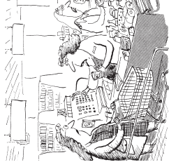
“WELL IT MAY HAVE BEEN 68 CENTS WHEN YOU GOT IN LINE, BUT IT’S 74 CENTS NOW!”

Policymakers can exploit the short-run trade-off between inflation and unemployment using various policy instruments. By changing the amount that the government spends, the amount it taxes, and the amount of money it prints, policymakers can influence the combination of inflation and unemployment that the economy experiences. Because these instruments of economic policy are potentially so powerful, how policymakers should use these instruments to control the economy, if at all, is a subject of continuing debate.